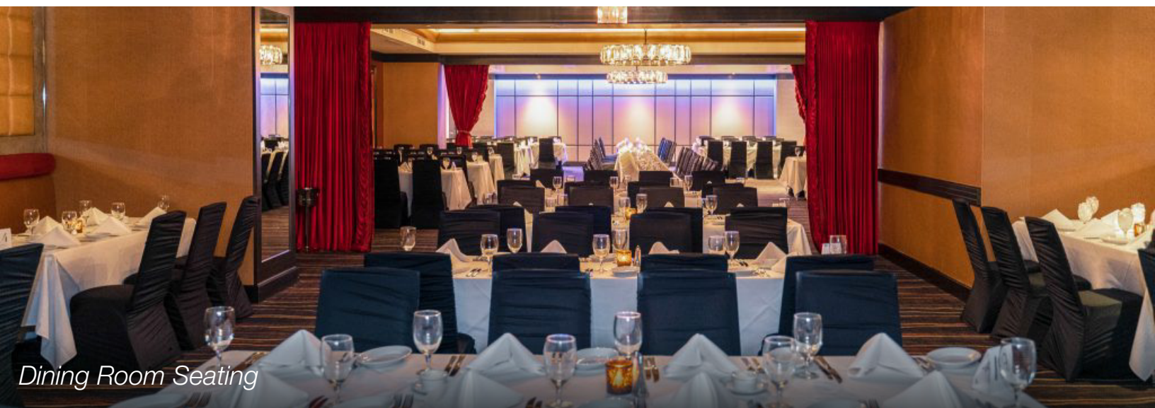
Dining Room Seating